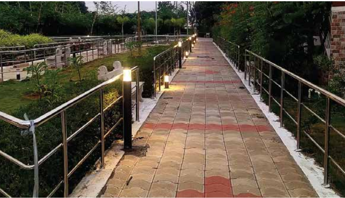
SMART CITY, TRICHY