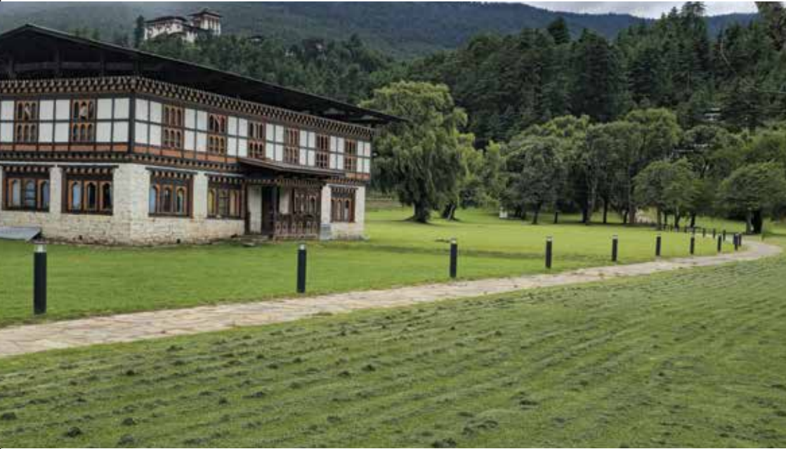
WANG PALACE, BUMTHANG, BHUTAN